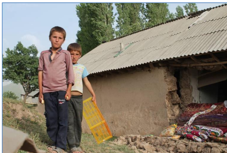
Affected children, Buston village, Tajikabad district

Preliminary estimates provided by the local branches of the Red Crescent Society of Tajikistan, indicate that 507 houses are damaged and unstable for further use across Tajikabad, Rasht and Sangvor districts. As of 12 July 2021 (17:00) State Commission on Emergencies confirmed full destruction of 49 houses in Tajikabad district, 16 in Rasht district and one house in Sangvor district. As the assessments are still on-going, damage data is expected to increase further.