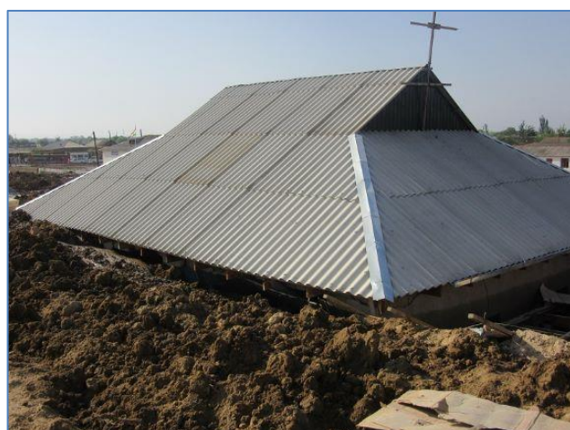
The roof of a houses flooded by mud. Khuroson district. 16 May 2020.

On 17 May 2020, local media report that the population of the affected villages in Khuroson district blocked Bokhtar-Dushanbe road, demanding assistance to the affected families.