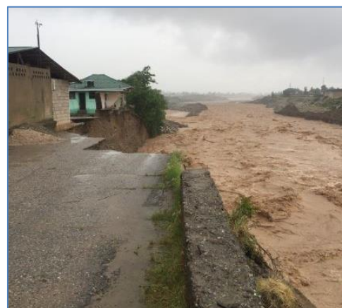
Destroyed bank of Kofarnihon river. 15 May 2020

As the precipitation continues, reinforcement and recovery of the damaged parts of the riverbanks is very challenging. Nonetheless, the situation is being monitored to ensure immediate response in case of deterioration.