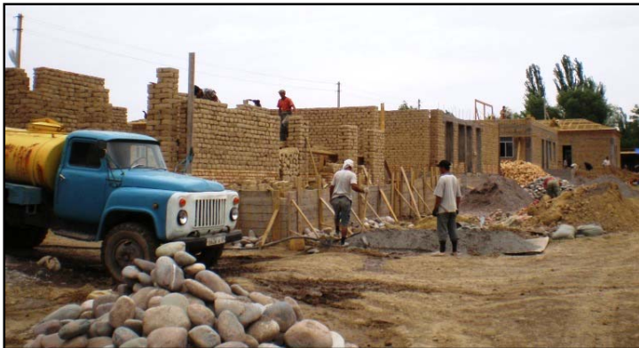
Photo 1: Progress of ongoing construction at the new settlement (plot 1)

Power supply lines and street lamps are still being installed. The construction of access and internal roads is also on-going.